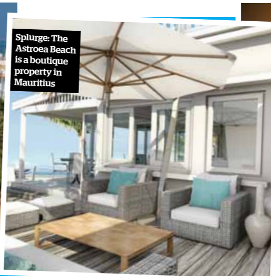
Splurge: The Astroea Beach is a boutique property in Mauritius