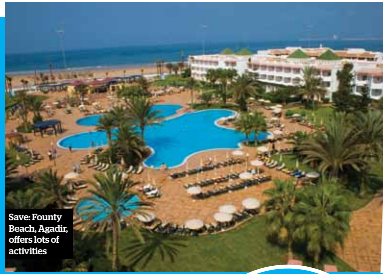
Save: Founty Beach, Agadir, offers lots of activities

For those after an affordable Caribbean stay, Ti Kaye Resort & Spa is a boutique hideaway in Saint Lucia, perched on the secluded cove of Anse Cochon and boasting one of the largest wine cellars in the region. A nearby reef and wreck make it a great spot for divers, and kayaking and volleyball are also available on the beach.