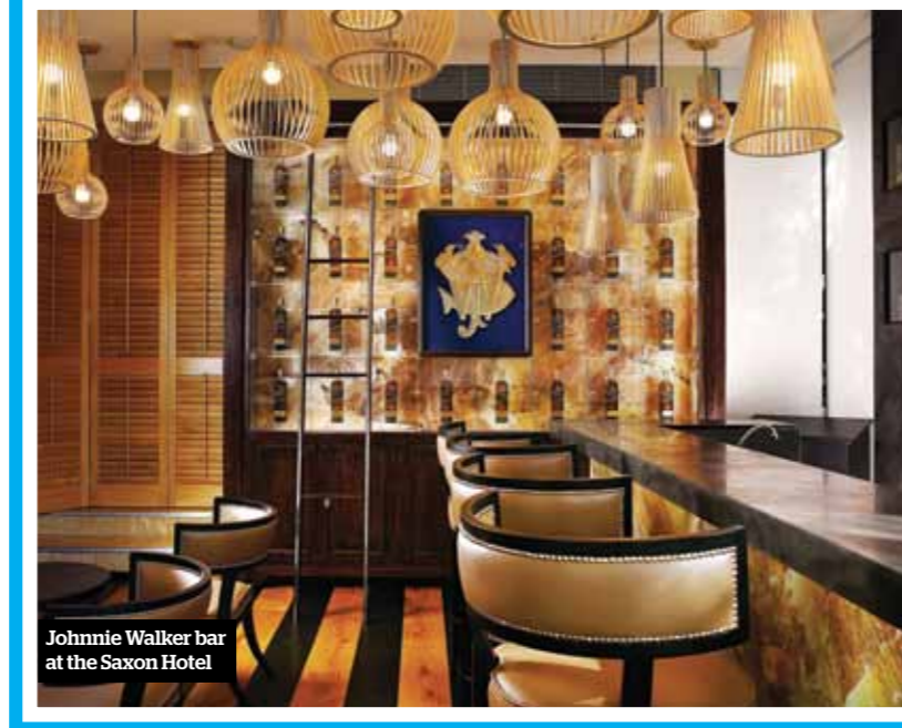
Johnnie Walker bar at the Saxon Hotel

has witnessed pivotal moments. Modern malls stand alongside shantytown housing, witness to both the progress and stagnancy that hit the country post-apartheid. Visitors can see Vilakazi Street – once home to two Nobel Peace Prize winners, Nelson Mandela and Desmond Tutu – visit a shebeen/bar, and the Hector Pieterse Museum, tribute to the fatal 1976 student uprisings. Township tourism is a sticky subject but ethical tours include the excellent bike or tuk-tuk tour from Lebo's Soweto Backpackers, Urban Adventures' Cycle Soweto and Phaphama's tours. 12.00. Stop for lunch at Sakhumzi on Vilakazi Street for traditional African dishes, burgers and salads. 13.30. The Apartheid Museum deserves a good few hours, with its excellent displays showing the effects of the regime on citizens. It's interactive, interesting and genuinely unmissable.