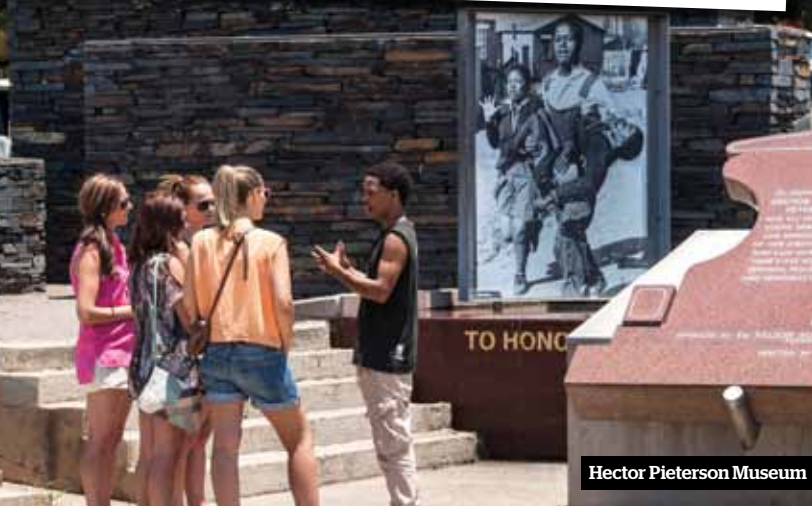
Hector Pieterse Museum

where inmates such as Nelson Mandela and Mahatma Gandhi were held, buildings include the 'Natives' section' prison blocks, Sections Four and Five isolation cells and the Women's Prisons. The guided tours are excellent and end inside South Africa's new constitutional court, built on the site where rights were often flouted.