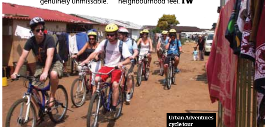
Urban Adventures cycle tour

There's a good cafe-restaurant for an afternoon pick-me-up. 17.00. Stop by Rosebank Mall's art and craft market, open daily, for its good selection of souvenirs and gifts. Goodman Gallery is also on Rosebank, renowned for its contemporary art collection and open until 7.30pm Tuesday to Thursday (4pm on Friday). 18.30. End the day at the Saxon Hotel in the suburb of Sandhurst, renowned for its African art collection and gardens. Owned by the same family who lived there before it became a hotel in 1992, Nelson Mandela chose to write his autobiography here. Book ahead to eat at Five Hundred or Qunu Grill restaurants, or prop up the bar at Eighteen05, the first Johnnie Walker whisky bar outside Scotland. Alternatively, suggest Seventh Street in the suburb of Melville, a lively strip of bars and restaurants with a neighbourhood feel. TW