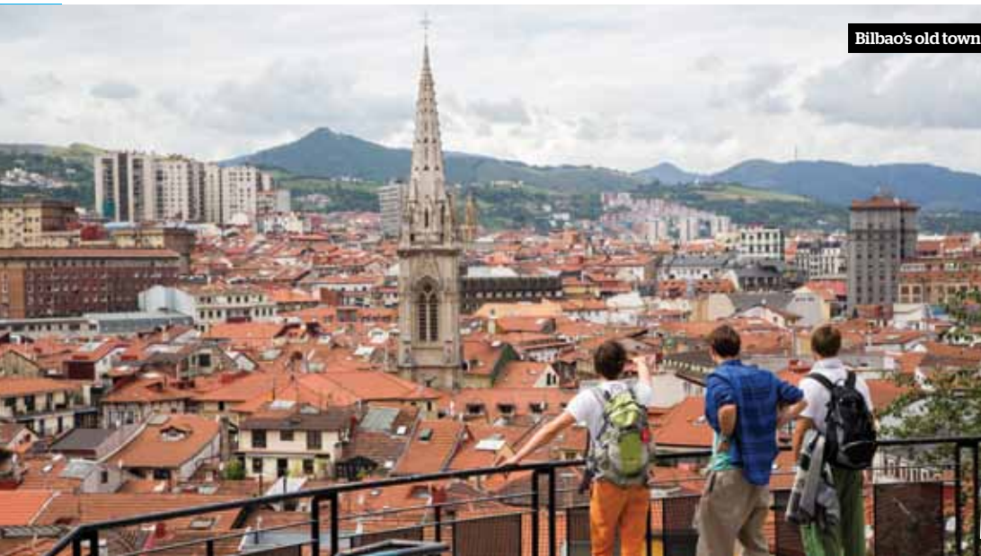
Bilbao's old town